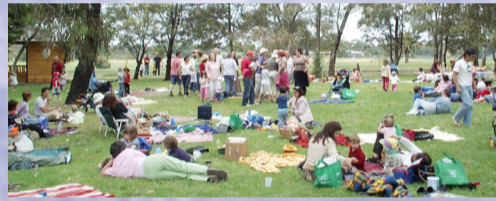
Community event organised at Pipemakers Park in conjunction with the Living Museum.