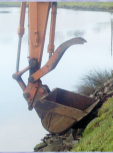
Melbourne Water upgrades the banks of the Maribymong as part of an environmental project running from the escarpment to the river organised by the Living Museum and funded by Envirofund.