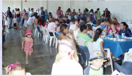
Aboriginal Santa arrives for the Gathering Place Christmas party at Pipemakers Park organised in partnership with The Gathering Place and Living Museum.