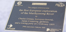
Plaque commemorating the bicentennial of the exploration of the Maribymong river by Europeans in 1803 was placed in Pipemakers Park near the River.