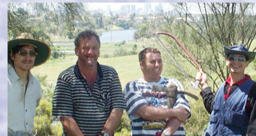
A group of men on 'Work for the Dole' project carrying out garden maintenance.