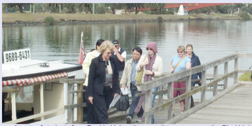
A party of students from Deakin University come the museum on the Blackbird for a workshop on how a community museum operates.