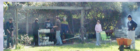
Disabled group participating in the development of an indigenous plant nursery at Pipemakers Park.