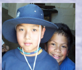
Visiting primary students enjoying their experience of local history and heritage at Pipemakers Park.