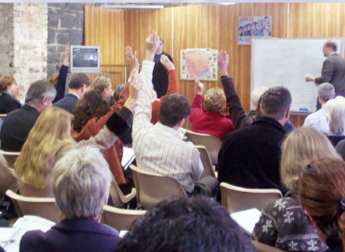
A forum on the future management of the Maribymong River organised by Maribymong City Council and hosted by the Museum.