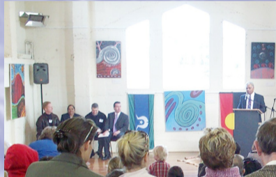
Launch of the Western Region NAIDOC Art event at the Incinerator in Moonee Valley.