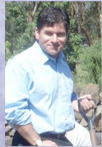
City of Maribymong Mayor, Joe Cutri lends a hand in the museum garden during a special community service day.