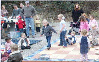
A family group enjoys the History of the Land Garden.