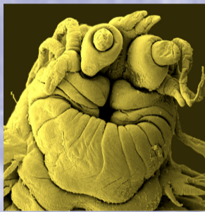
The wonder of microscopic life in the Maribymong mud is discovered as part of a special microscope survey carried out by WSL Laboratories for an exhibition being developed about animals in and about the Maribymong River.