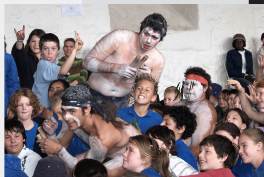
Aboriginal Dance Group, 'One Fire', mingles with the crowd of kids at the 'Meet the Neighbours' event. One Fire performed dances about indigenous animals such as the kangaroo and emu.