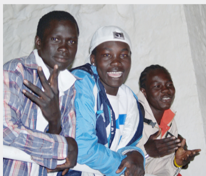
These boys were part of the audience at 'Meet the Neighbours'; they asked to have their photo taken.