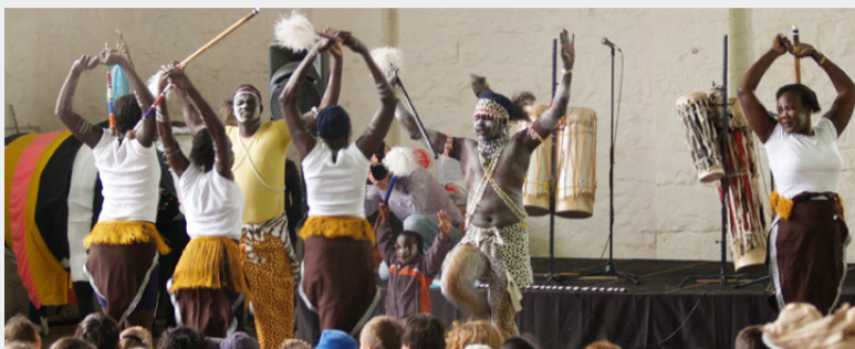
The Dambai Dancers from Sudan perform their sacred cow dance at the 'Meet the Neighbours' concert.