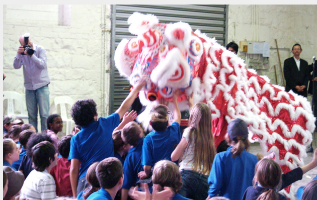
The Chinese Youth Association performs the Lion Dance at an event called, 'Meet the Neighbours', which was a concert of stories, songs and dances celebrating animal stories in different cultures. The event was put on in partnership with the Maribyrnong Refugee Week Committee.