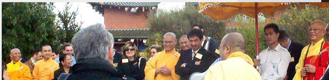
A project developed from a partnership with Footscray City Secondary College, the Quang Minh Buddhist Temple in Braybrook and the Living Museum came to fruition at the Temple on May 7th, Buddha's birthday. The project was for secondary school students, to build nesting boxes for local indigenous bird life to be placed around the Temple and the surrounding area. As Buddhism strongly supports and celebrates animals the project launch was a feature of the Birthday celebrations and a variation on the traditional form of animal involvement in the ceremony for Buddha's Birthday.