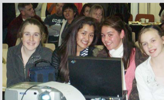
The outcomes of a special project to develop curriculum notes focussing on the issues in the exhibition, 'Pobblebonk' about the Maribyrnong river estuary were presented in a special Showcase event at the Museum in August. The research project was developed in partnership with the School of Education at Victoria University and Footscray City Secondary College.