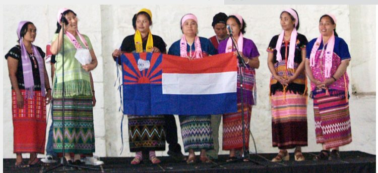
'Meet the Neighbours' - Women from the Karen Association explaining the significance of the frogs on their flag.