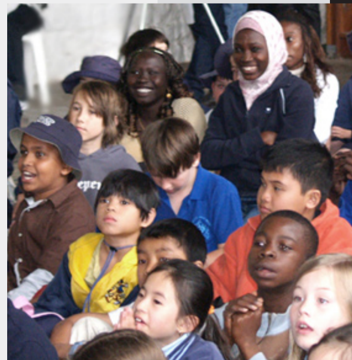
Cover: Audience at the 'Meet the Neighbours' concert in October 2006.