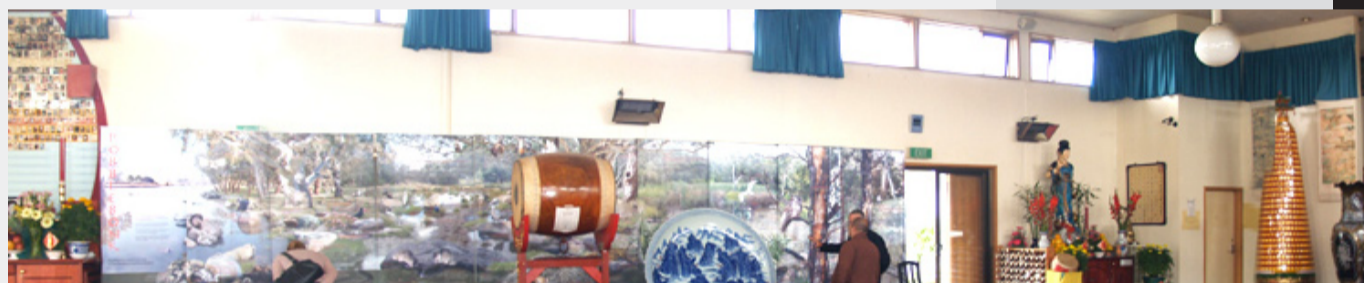
The new exhibition, 'Pobblebonk'; about animals of the Maribyrnong River Estuary, made its first touring debut at the Quang Minh Temple for Vietnamese New Year on January 28th. The exhibition was seen by thousands of visitors.